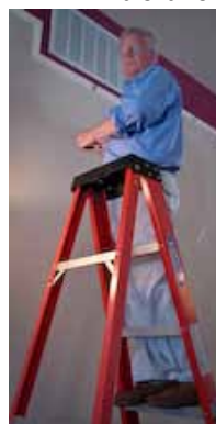
On top of the world