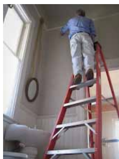
Bill Who hangs photos in the bathroom?