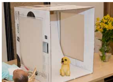
A home-made lightbox