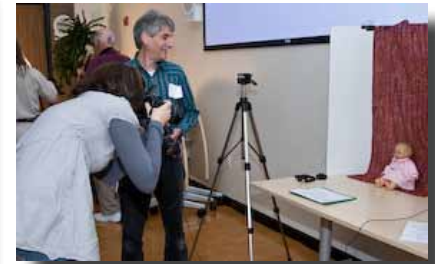
A guest tries out her flash